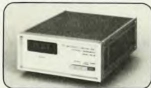
DRC-80 Thermometers feature dual-sensor input, interchangeable sensors, BCD and IEEE interfaces.