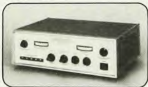
Versatile DTC-500A provides three-term temperature controllability to better than \pm 0.5 millikelvin.

Whether your needs call for detection, measurement, or control of cryogenic temperature, Lake Shore can help. A wide selection of sensors, compatible instrumentation, reliable temperature calibrations, and competent applications assistance are just a few of the reasons you should come to Lake Shore . . . we know cryogenics COLD!