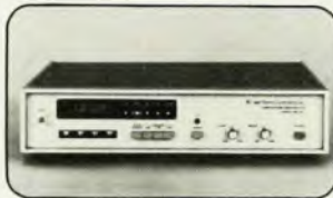
DRC-84C Temperature Controllers combine si-diode sensors and platinum RTD's to span 1.4 to 800K range.