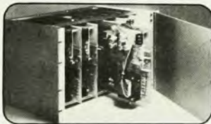
CST-900 Transmitters convert cryogenic temperatures to 4-20mA signals for industrial monitoring.