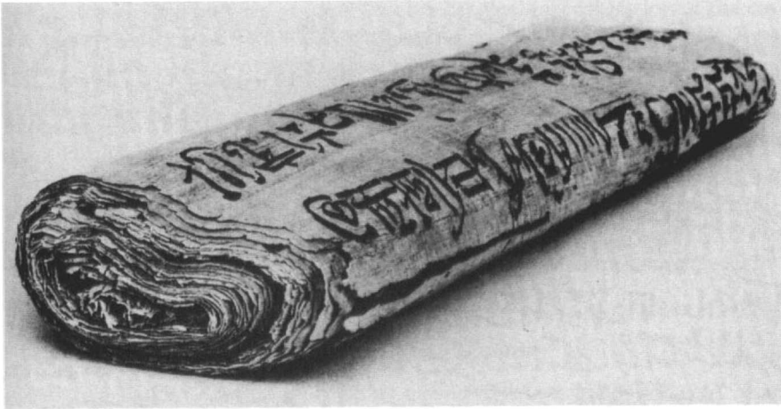
Figure 5 Egyptian Papyrus role. The figure depicts, not the Edwin Smith Surgical Papyrus, but the similar external appearance of the Chester Beatty Papyrus, No. 1 in the British Museum. The picture is taken from the frontispiece of The Chester Beatty Papyri, No. 1 , by A.M. Gardner, printed by John Johnson at the Oxford University Press and published by Emery Walker Ltd.

and 2,150 BC. These dates are not precise and the technical language of this document would change more slowly than other written language. We come to an estimate of the age of the original text at over 4,000 years and the copy some hundreds of years, possibly 1,000 years, later.