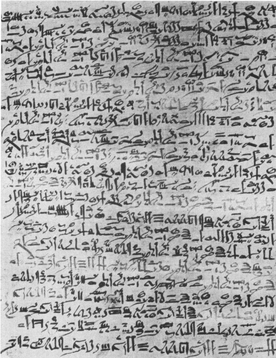
Figure 6 Column X of the Edwin Smith Surgical Papyrus, written in hieratic script, and describing cases 29–31. The writing proceeds from above down and from right to left. Those parts of the script which appear lighter were entered in red to denote headings of the text. This picture (plate V) and that in Figure 7 (plate XVII) are taken from Breasted J.H. (1930).

were ‘restored’ by Breasted who judged them to have been originally present in the document. I have then added to each case my own comments, under the heading ‘modern commentary’. The magnificent work of Breasted gave us a transliteration into hieroglyphic and a detailed translation with copious notes on the exact meaning of the original. Professor Breasted had the assistance of Dr